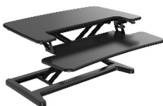
ERGO DESK 2

To fight against MSDs and a sedentary lifestyle, it is necessary to move more, while being able to be productive in the tasks entrusted to us. Sit-stand solutions give you the opportunity to energize your work day. It is for all these reasons that UNILUX offers you a wide range of ergonomic accessories ranging from footstools to electric desks, dynamic stools and sit / stand workstations. Being more active has become a societal issue. A first goal would be to spend at least 2 hours a day standing at work and then try to reach an ideal duration of 4 hours.